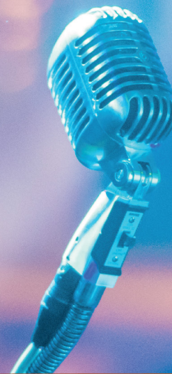
EXHIBIT. SPONSOR. SPEAK.

Welcome Back. We Missed You! The MEGA Marketplace will follow social distancing and other safety protocols to help ensure everyone's safety as we welcome you back to in-person events. Further details will be provided in the exhibitor/sponsor kits. For details go to: ficpa.org/ficpa-cpe-covid-19-safety-plan